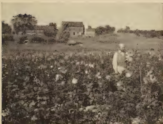
VIEW OF 3 ACRE FIELD